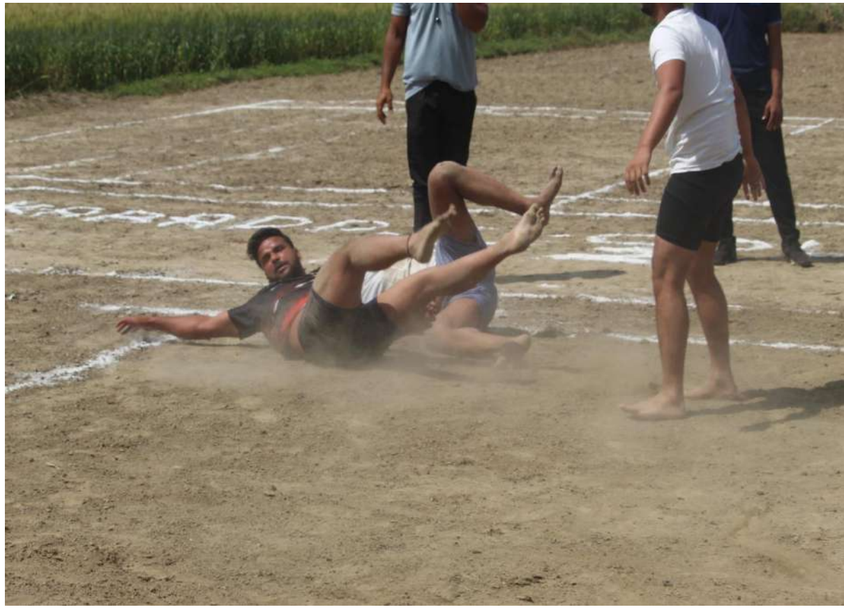
Department of Physical Education: Annual Sports Report