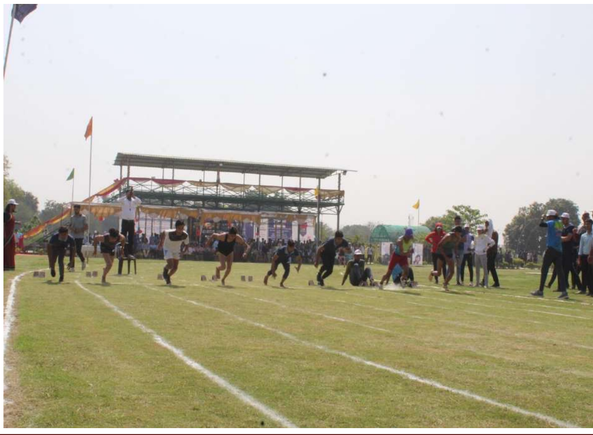
Department of Physical Education: Annual Sports Report