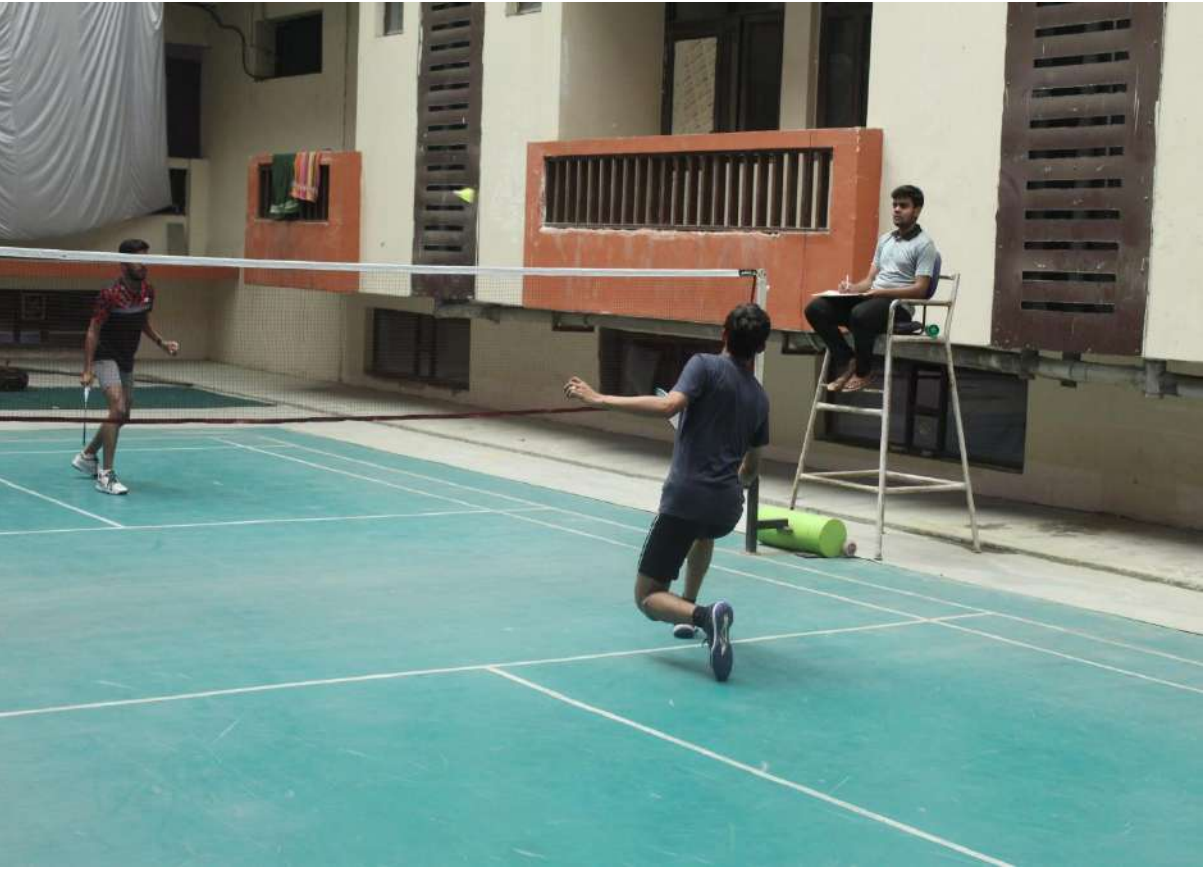
Department of Physical Education: Annual Sports Report