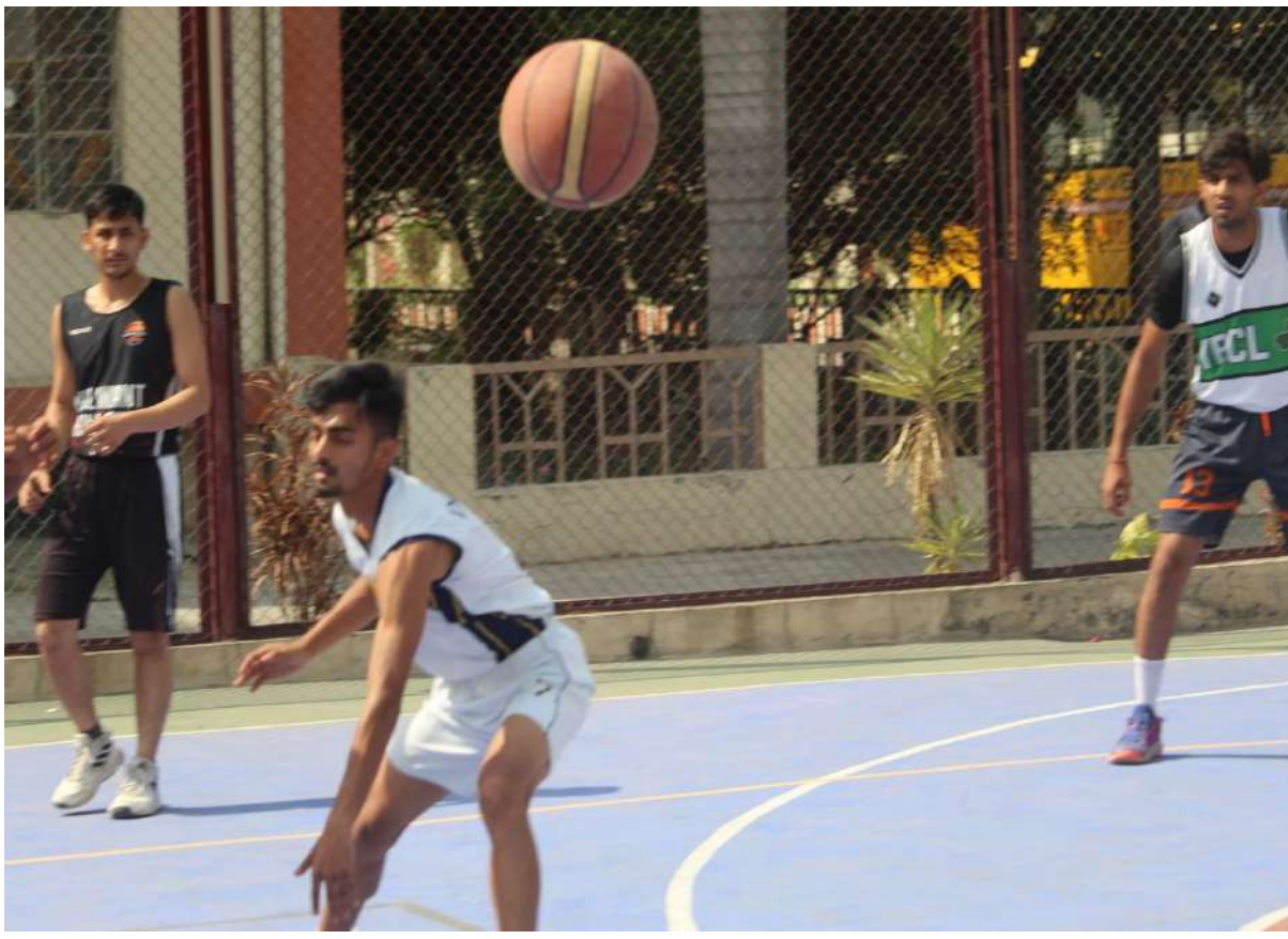
Department of Physical Education: Annual Sports Report