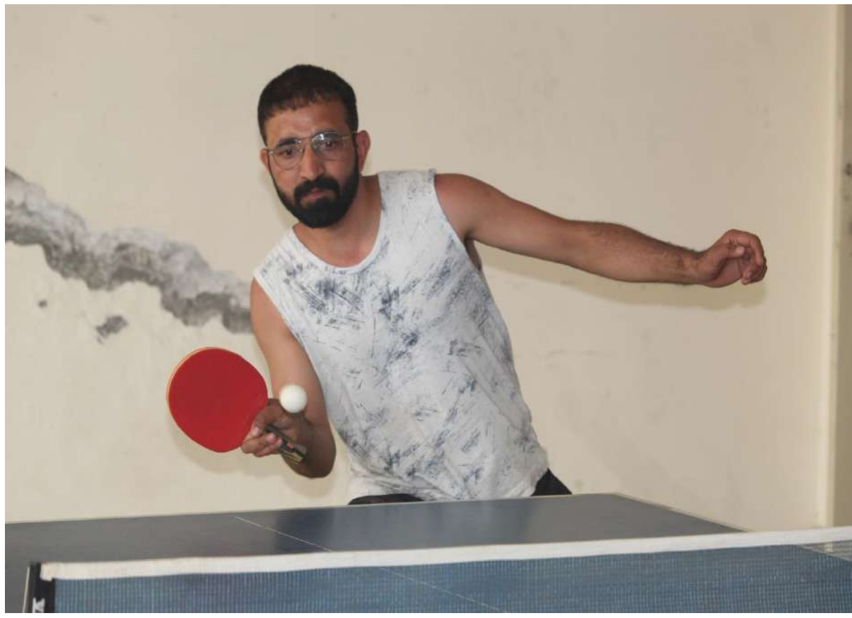
Department of Physical Education: Annual Sports Report