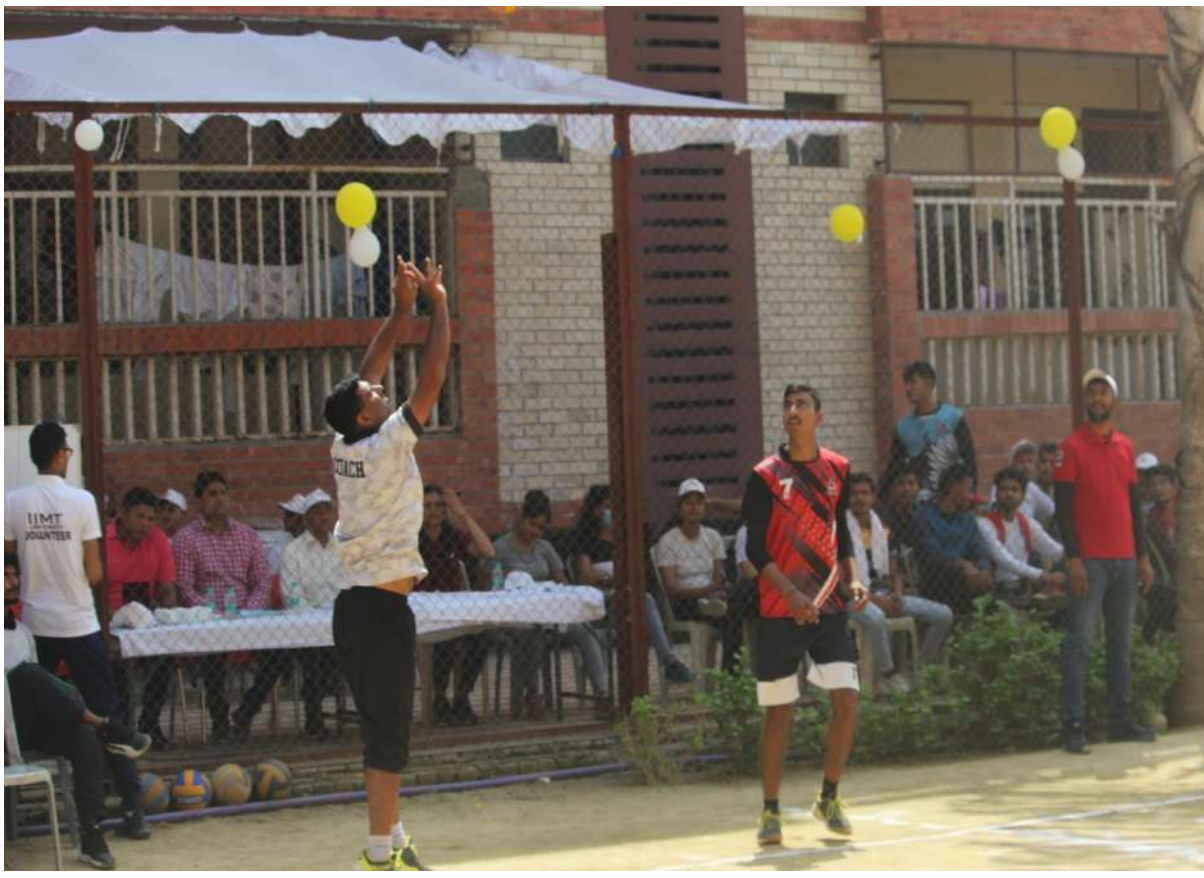
Department of Physical Education: Annual Sports Report