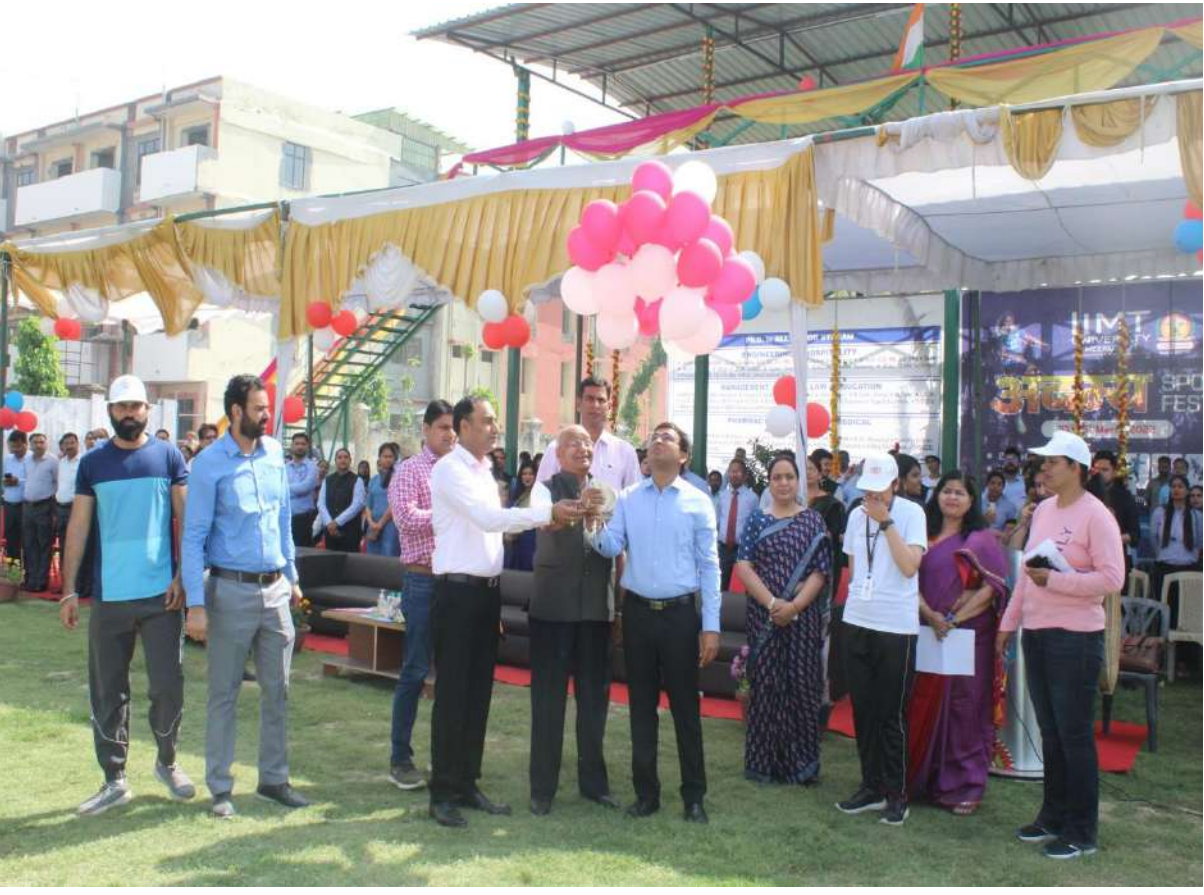
Department of Physical Education: Annual Sports Report