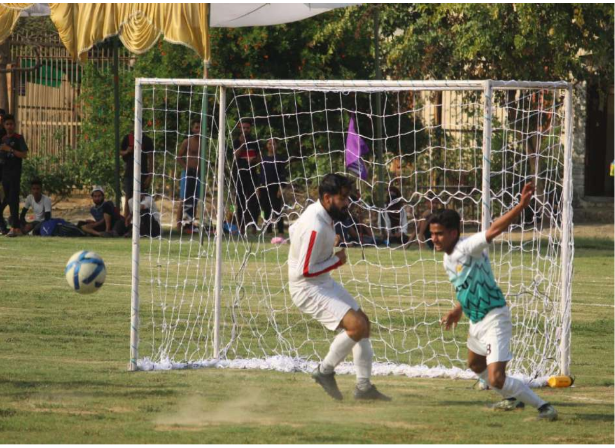
Department of Physical Education: Annual Sports Report