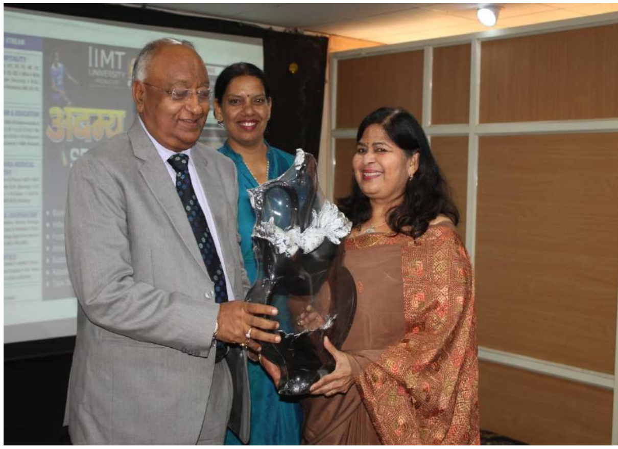
Department of Physical Education: Annual Sports Report