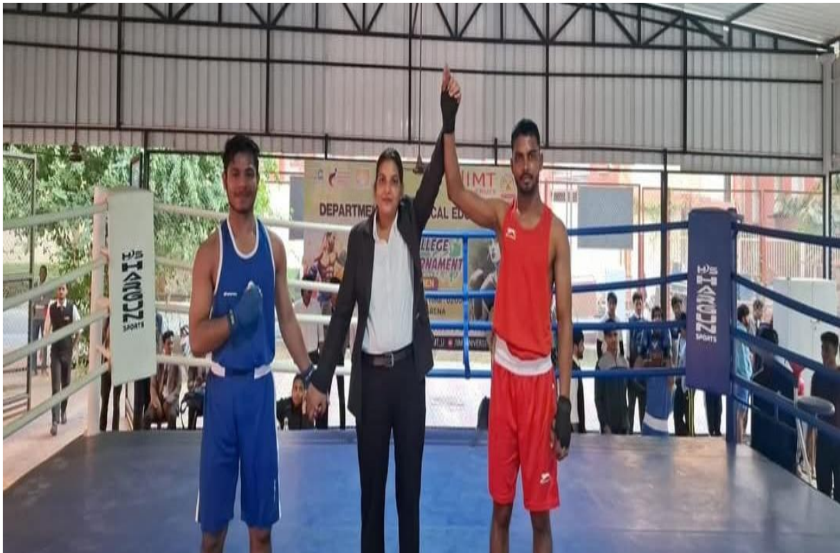
Inter-College Boxing (Men & Women)