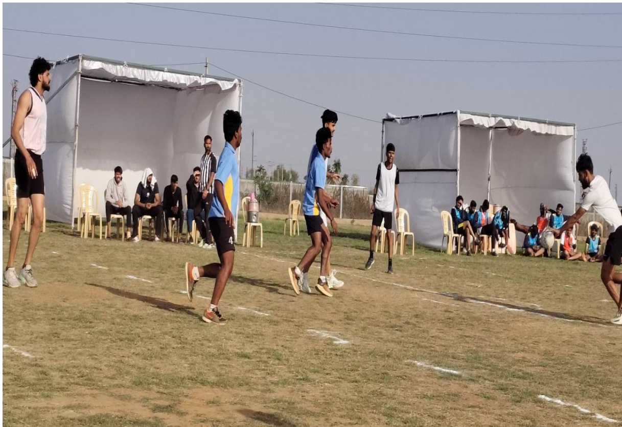
All India Inter-University Target ball Championship (Men)