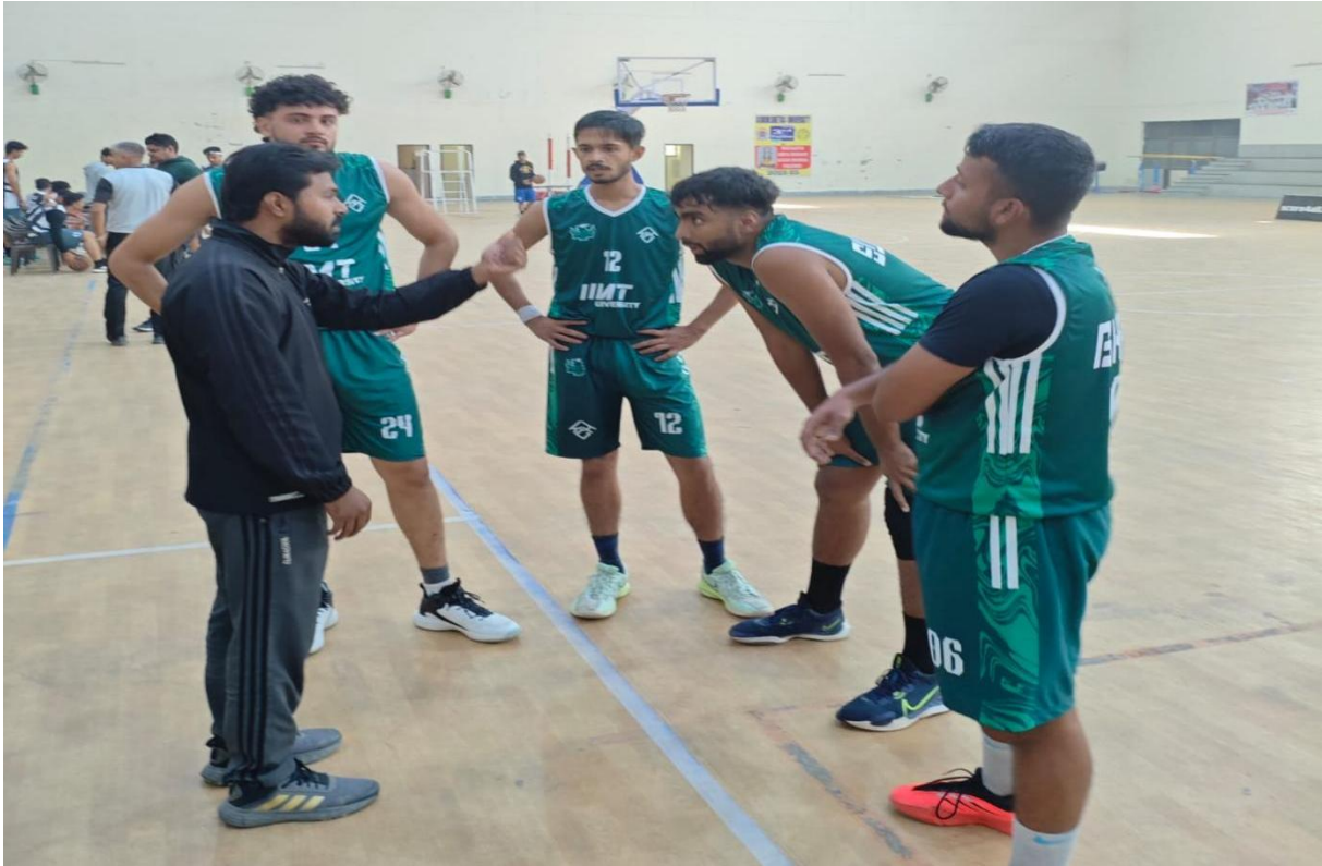
North Zone Inter-University Basketball Championship (Men)