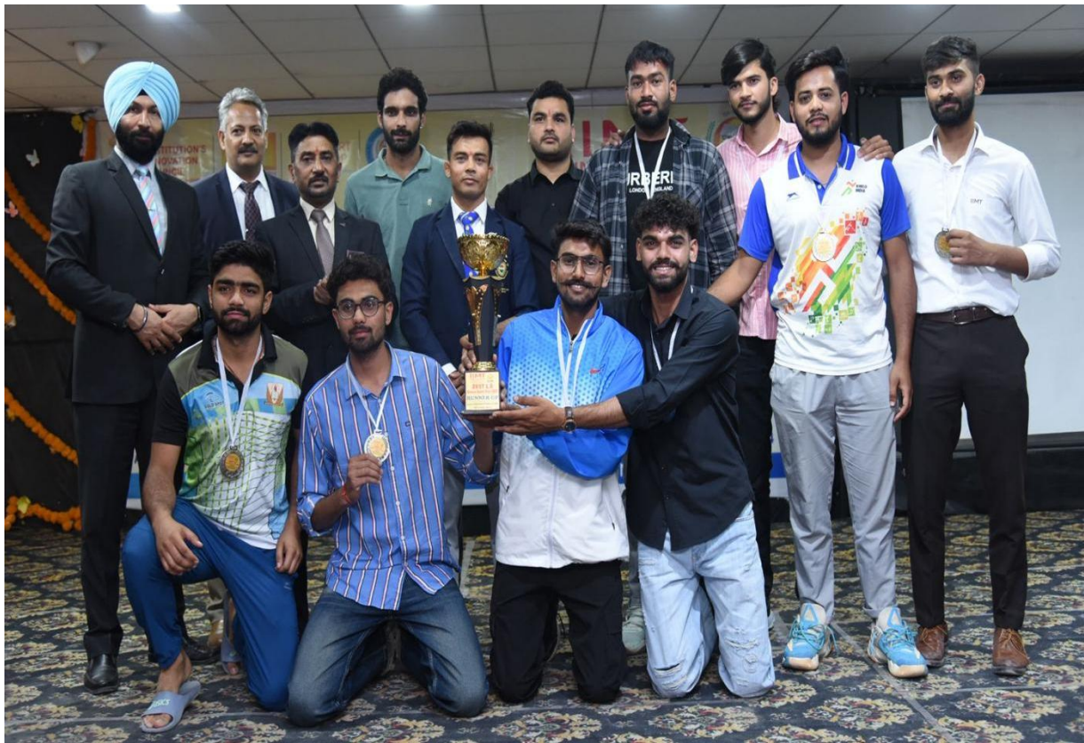
Zest 1.0 Annual Sports fest (2025)