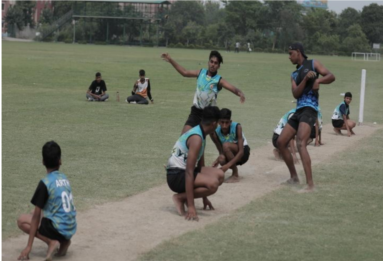
Meerut Khel Mahotsav (2025)