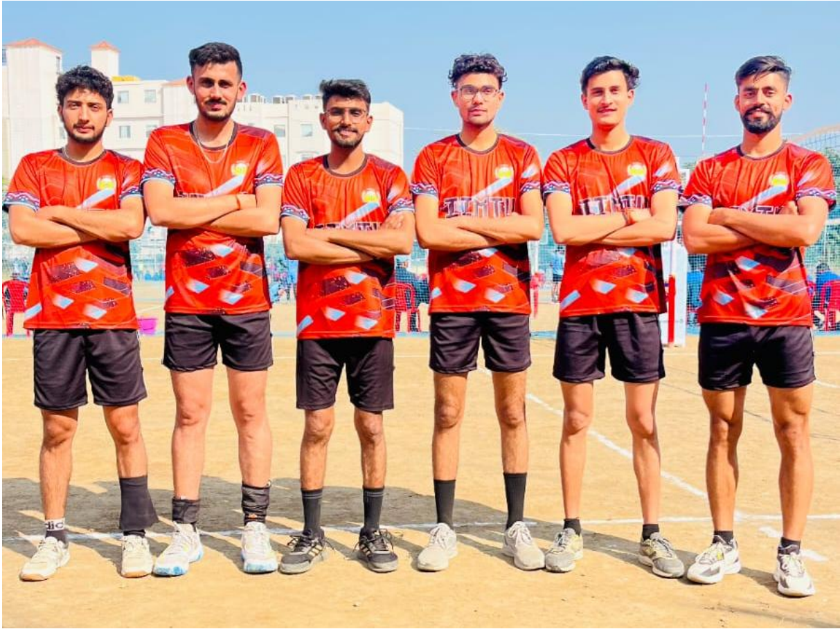
North East Zone Volleyball Championship (Men)