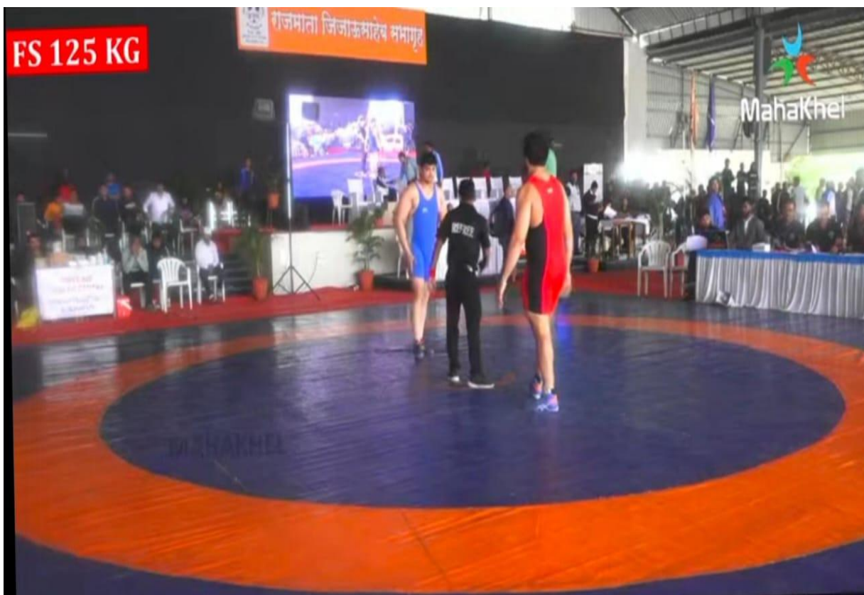
All India Inter-University Wrestling Championship (Men)