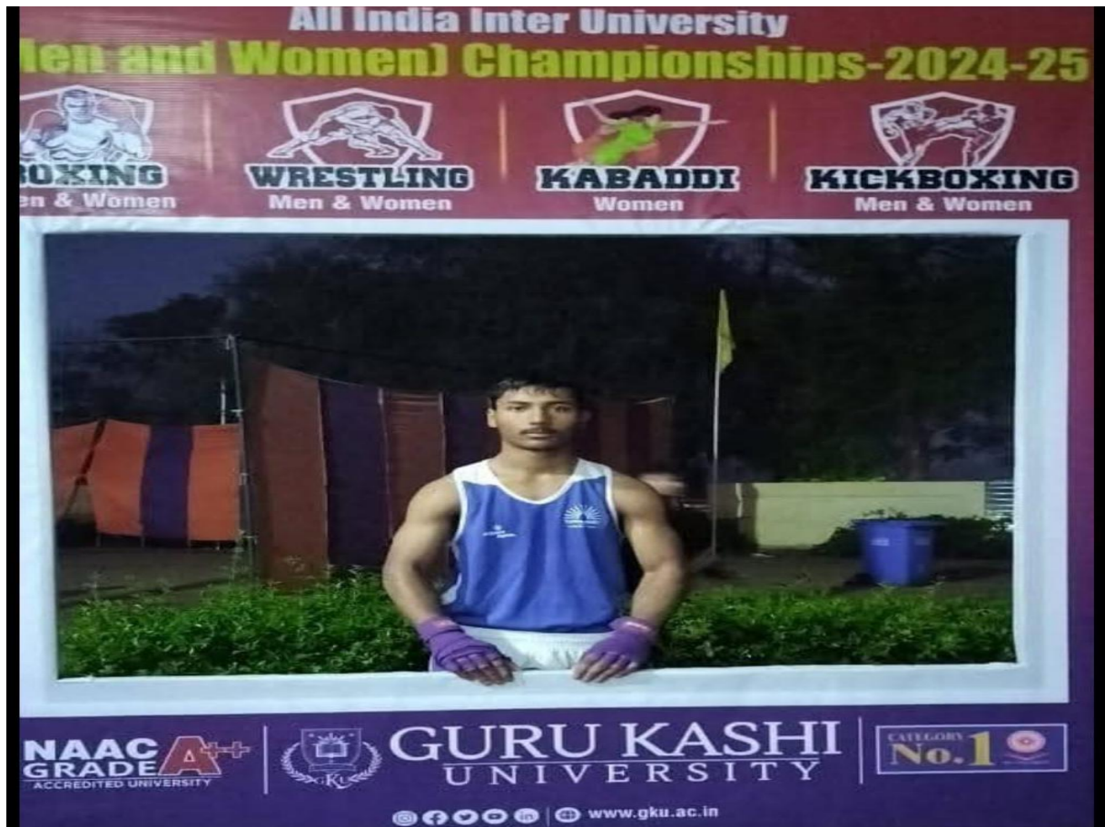
All India Inter-University Boxing Championship (Men)

Appendix (includes photographs, brochure):