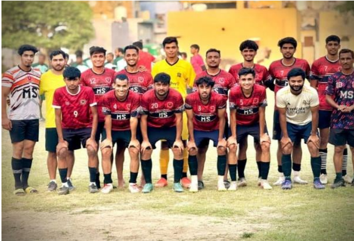
Meerut Khel Mahotsav (2025)

Basketball: In The Meerut Khel Mahotsav basketball event saw dynamic performances and high energy across all matches. Teams from various institutions competed with great enthusiasm, exhibiting skill, strategy, and sportsmanship. The girls' basketball tournament was equally competitive, with young athletes showing impressive talent and discipline. The final match was an exciting contest filled with close calls and great coordination.