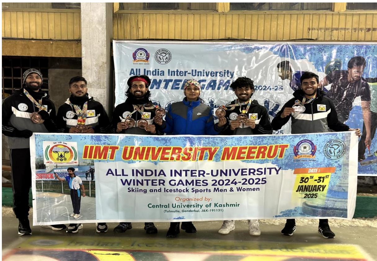
All India Inter-University Winter Game (Ice Stock Sport)