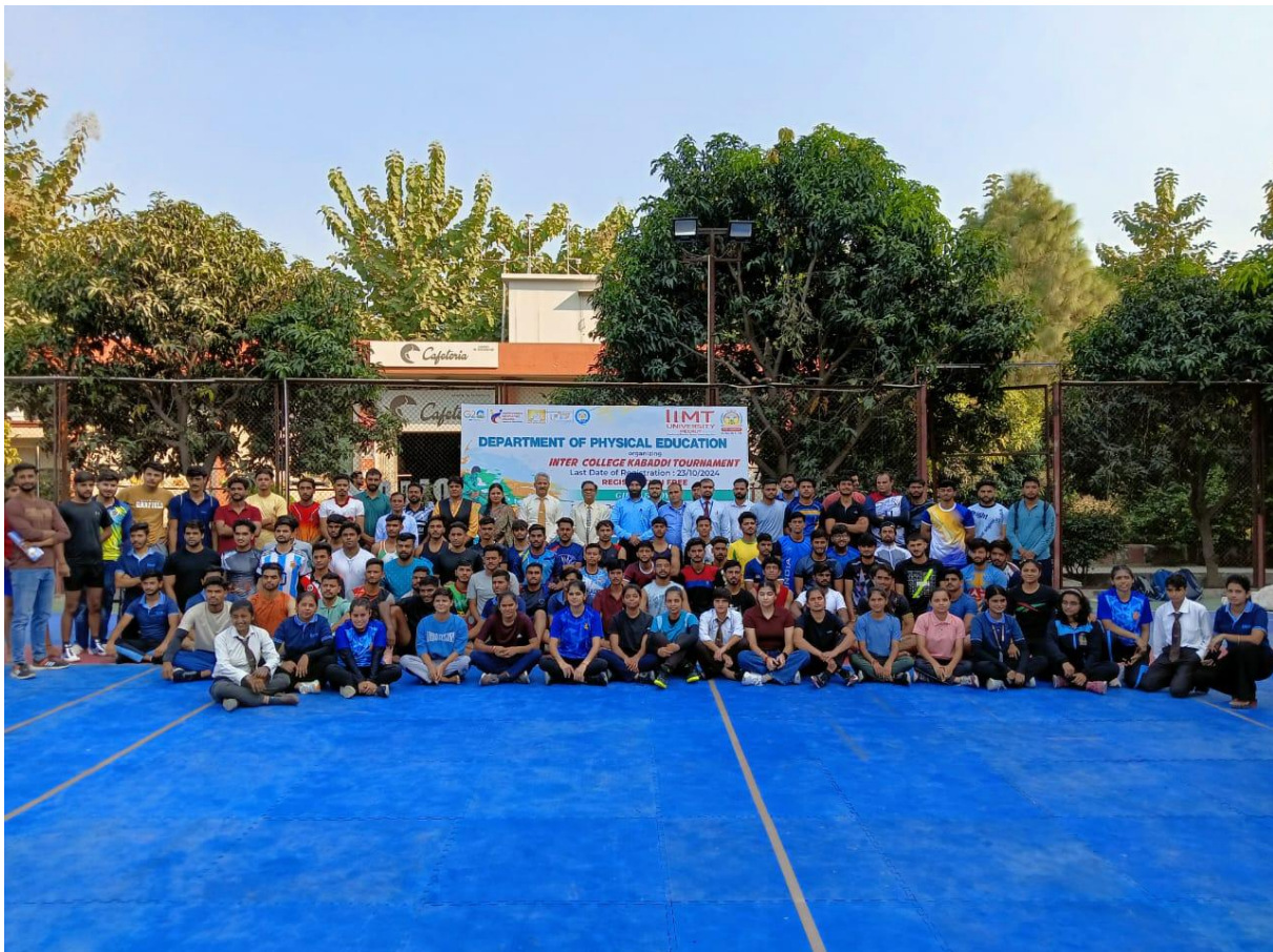
Inter-College Kabaddi (Men’s & Women’s)