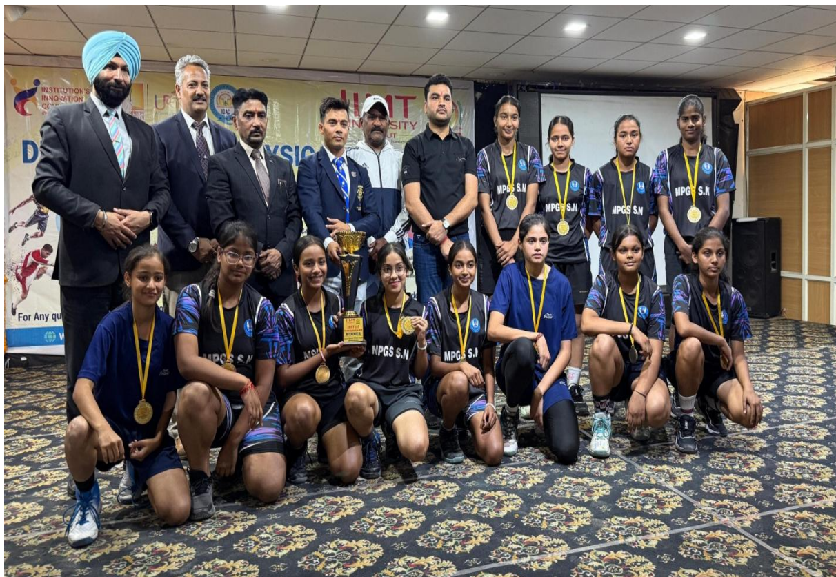
Zest 1.0 Annual Sport Fest (2025)