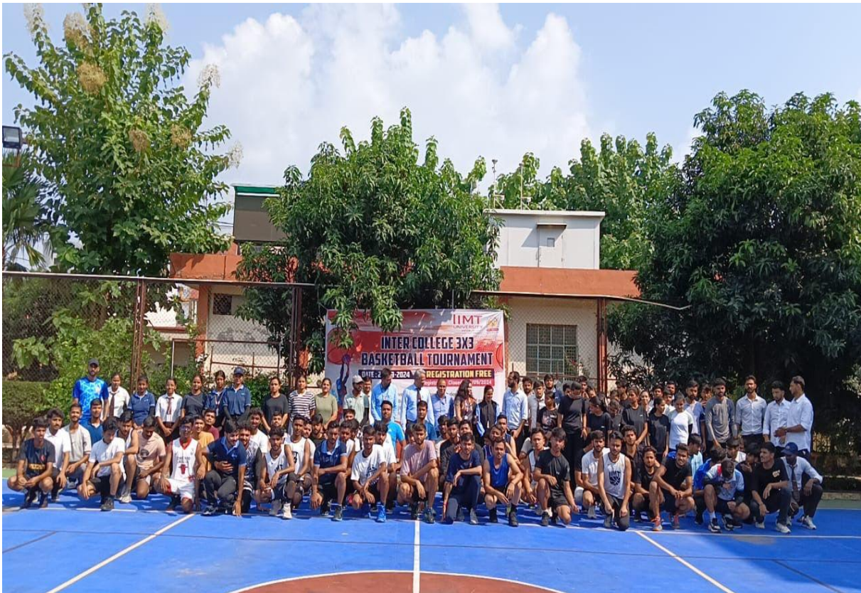
Inter-College Basket ball (2024-25)