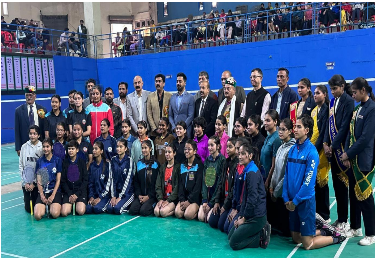
North Zone Inter-University Badminton Championship (Women)