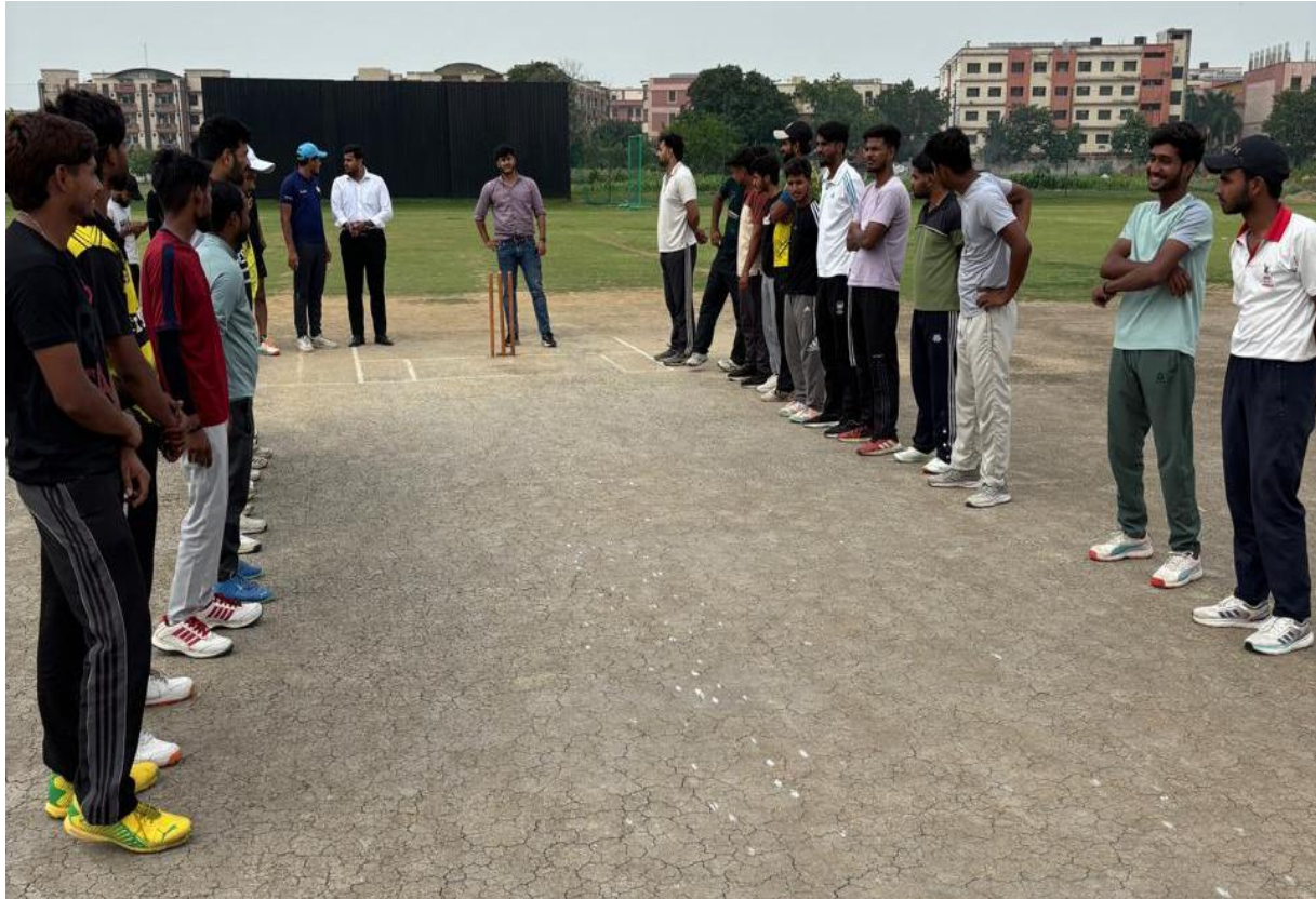
Meerut Khel Mahotsav (2025)

Cross Country: the Cross Country Event organized as part of the Meerut Khel Mahotsav 2025 .