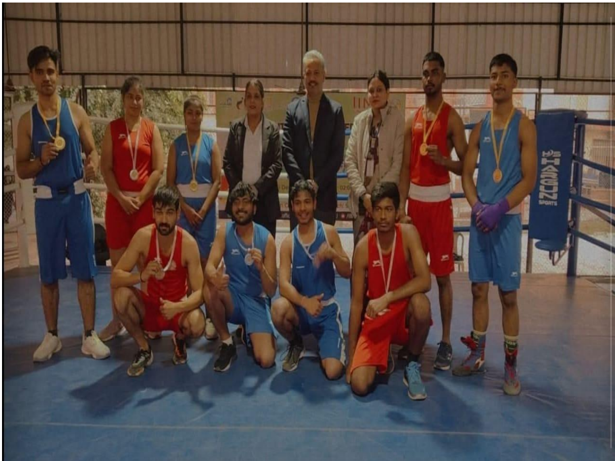
Inter-College Boxing (Men & Women)