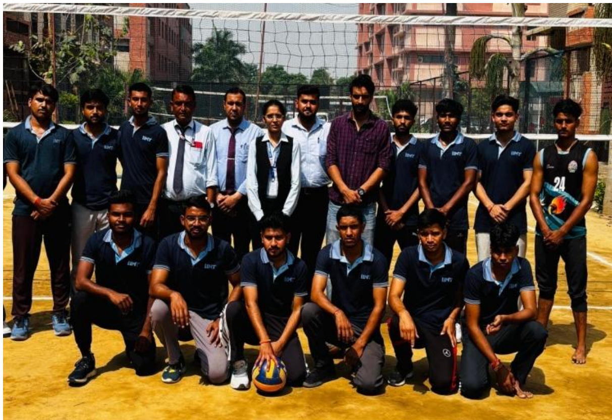
Inter-College Volleyball, (Winner and Runner-up team)