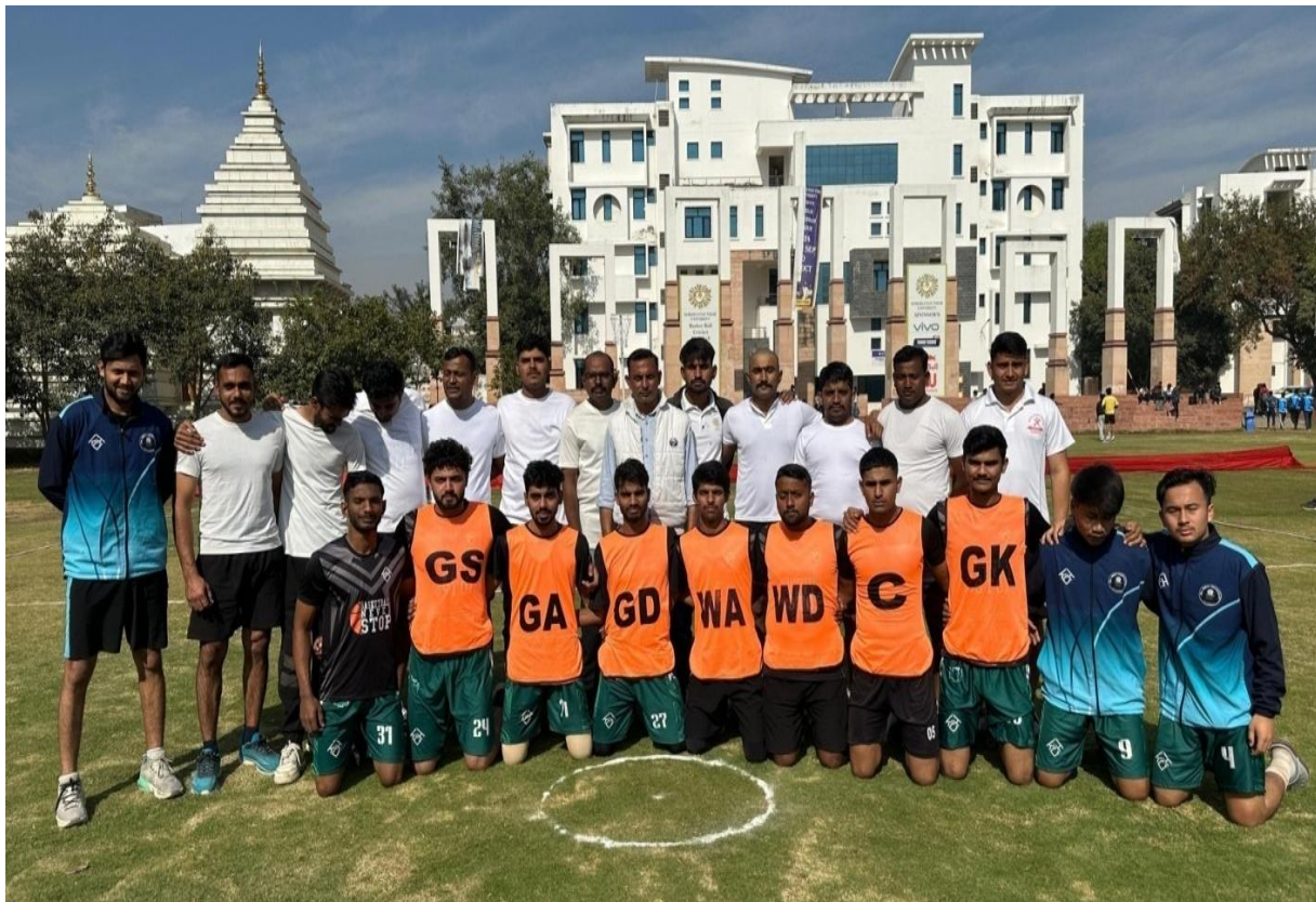
All India Inter-University Netball Championship (Men)