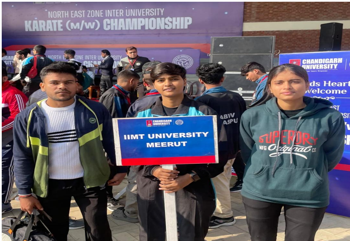
North Zone Inter-University Karate Championship (Men & Women)

Appendix (includes photographs, brochure):