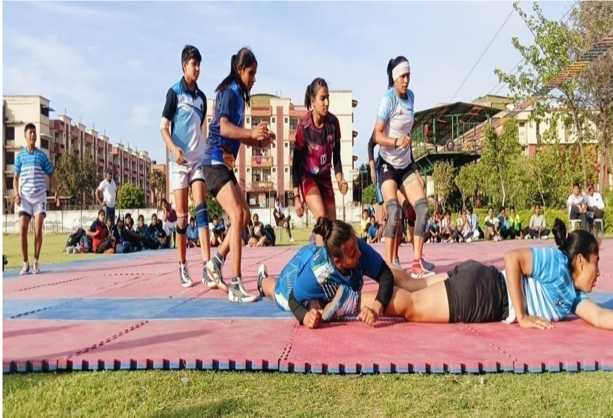
Zest 1.0 Annual Sport Fest (2025)