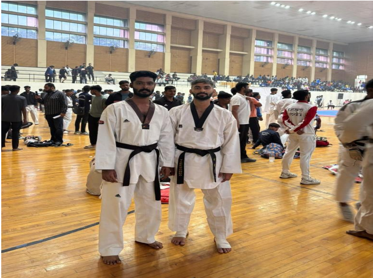
All India Inter-University Taekwondo Championship (Men)