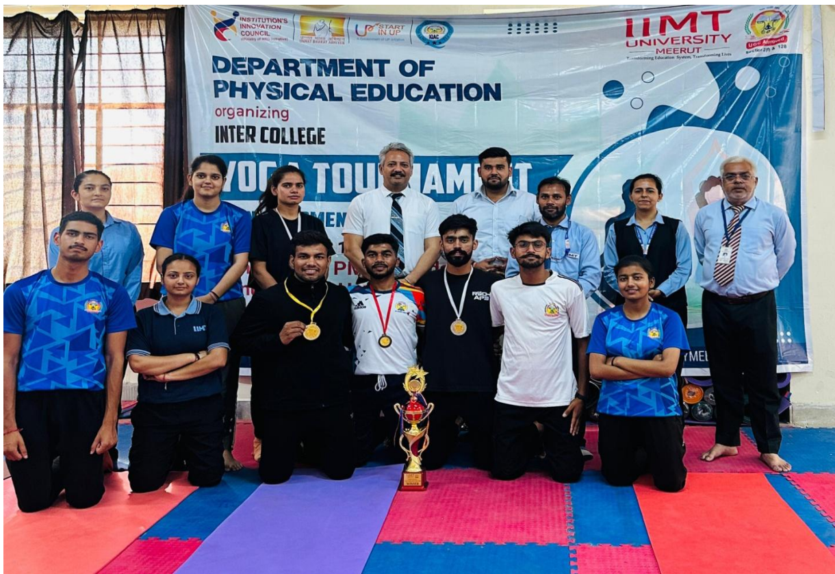
Yoga Inter-College (Men & Women)