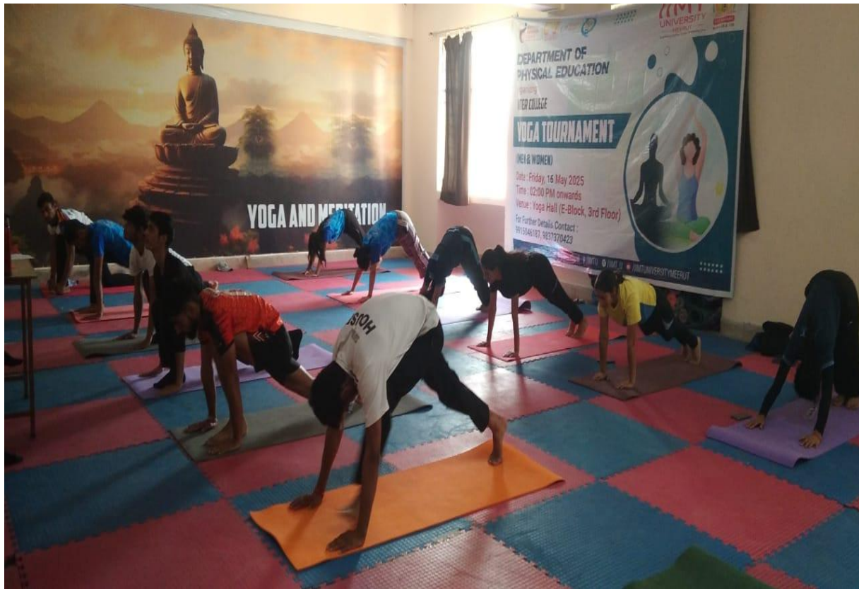
Yoga Inter-College (Men & Women)