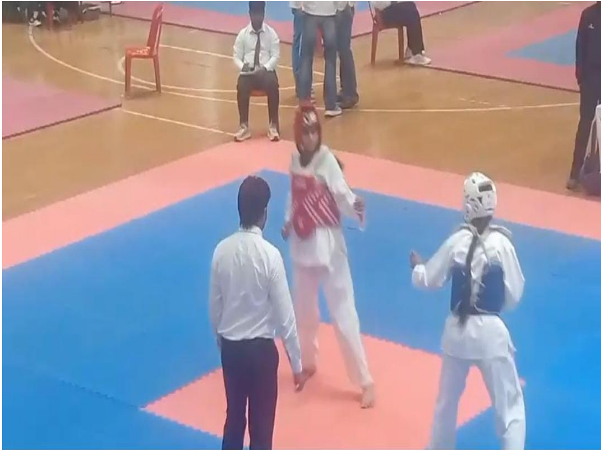
All India Inter-University Taekwondo Championship (Women)