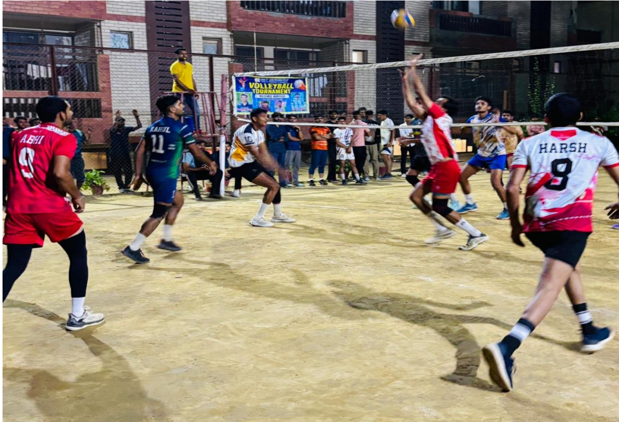
Meerut Khel Mahotsav (2025)