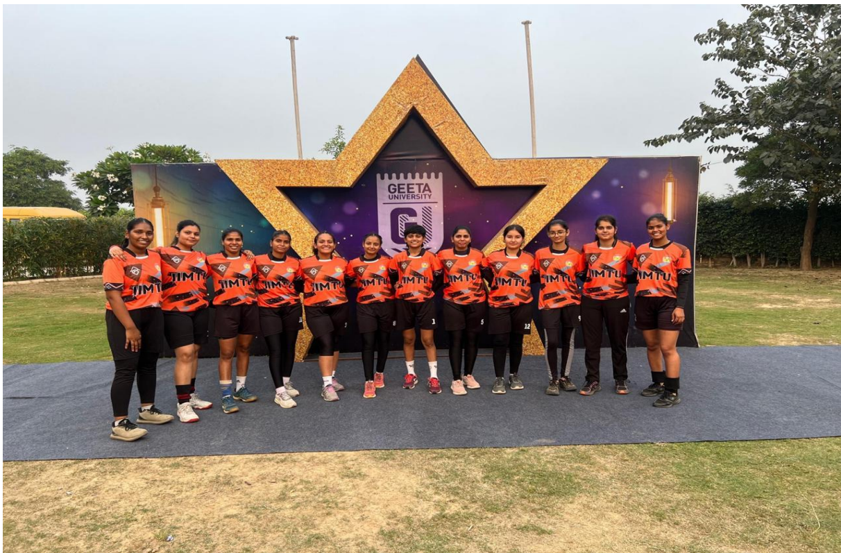
North Zone Volleyball Championship (Women)