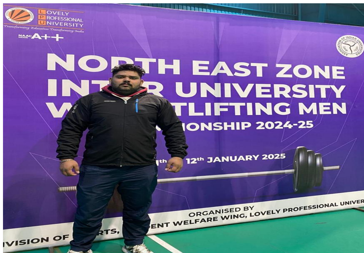
North East Inter-University Wt. Lifting Championship (Men)