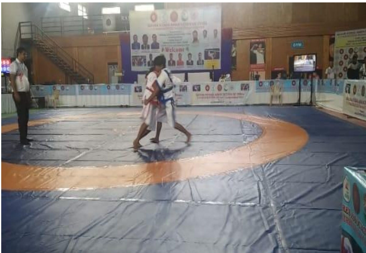
North Zone Inter-University Judo Championship (Men & Women)