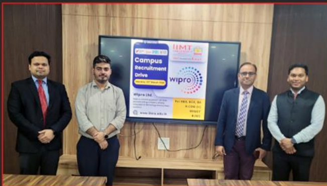
WIPRO - Campus Drive (India's 4th largest IT Company)