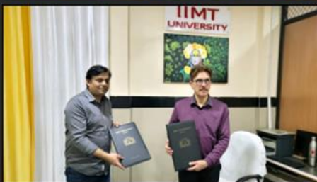
MoU with Weit Cloud and many more MoUs have been signed by IIMT University..