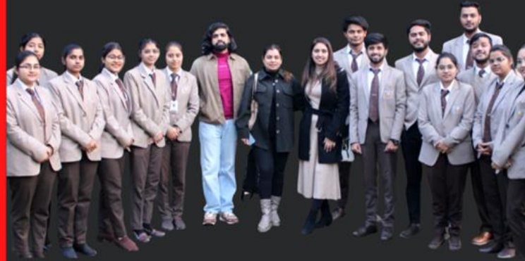
Calvin Klein & Tommy Hilfiger - Campus Drive (A Leading American Fashion Brands)