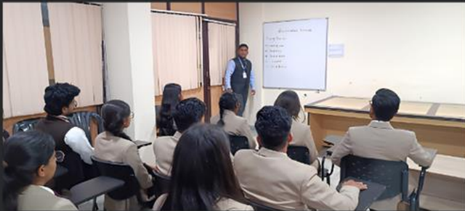
Aptitude for Competitive Exams & Campus Placement Preparation