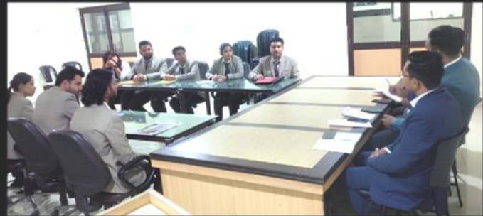
Mock Interviews & Group Discussions