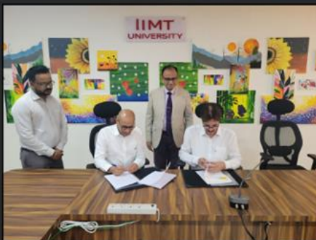
MoU with Naukri.com (Naukri Campus)