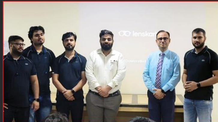
Lenskart.com - Campus Drive (One of the largest eye-wear brands in Asia)