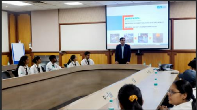
Uno Minda Group