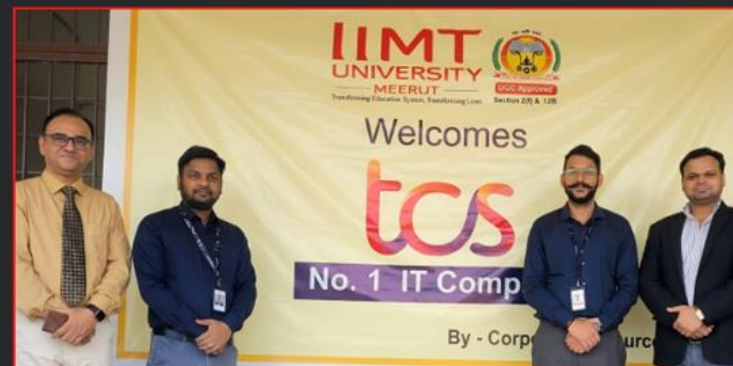
TATA Consultancy Services - Campus Drive (India's largest IT services company with a worldwide presence)