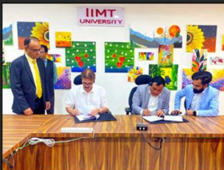
MoU with The Times Group (Times Edutech and Events Ltd.)