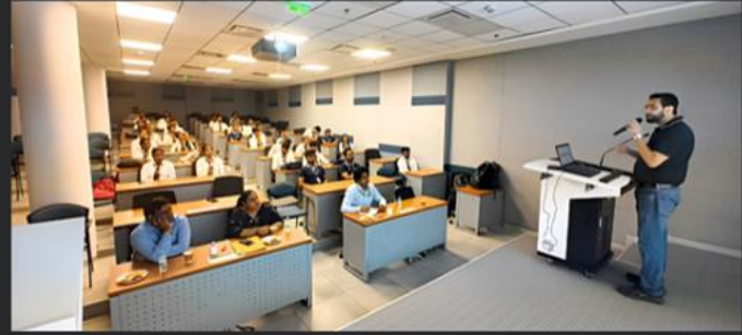
Technical Skills - Corporate Trainings