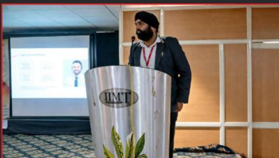
TechMahindra - Campus Drive (India's leading IT company - Mahindra Group)