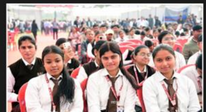
JOB FAIR PARTICIPANTS