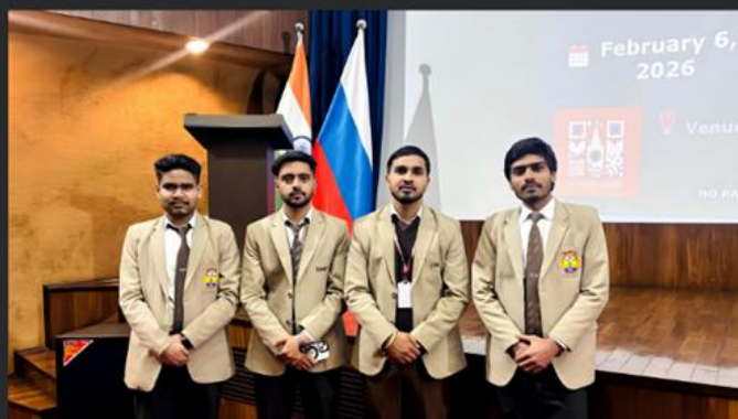
E-Cell Visit to the Embassy of the Russian Federation