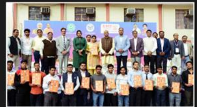
RESULTS & OFFERS