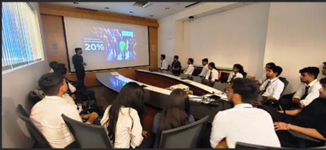
Soft-Skills - Corporate Trainings