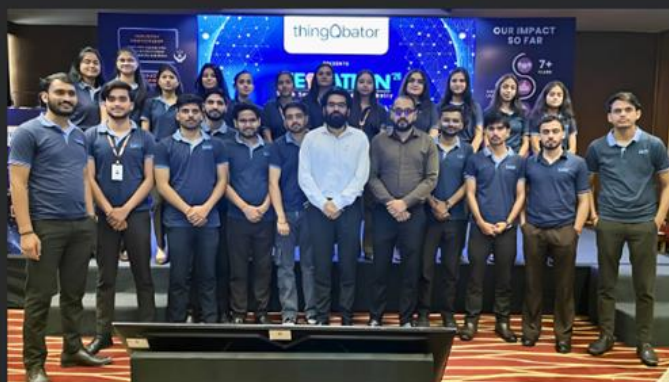
NASSCOM Foundation visit for thingQbator Finale