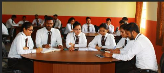
Strategic Case Studies - Forum