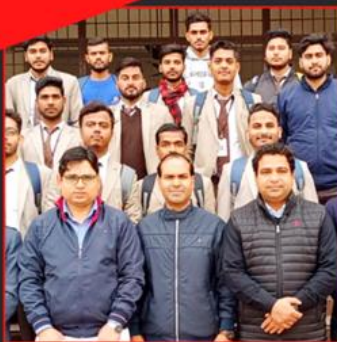
SKH Metals - Campus Drive (A core automotive sheet metal manufacturer under Krishna Group, aligned with Maruti Suzuki and other OEMs)