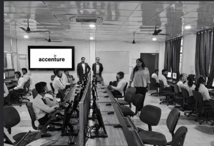
Accenture - Campus Drive (A Leading IT Company - Having Presence in 120 Countries Worldwide)