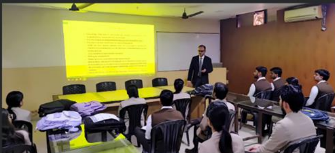
Guidance & International Career Road Mapping