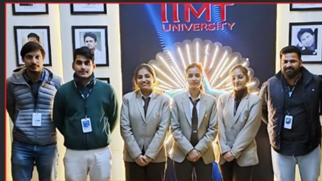
Decathlon - Campus Drive (World's largest sporting goods brands)