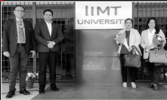
ICICI Bank - Campus Drive (India's 3rd largest bank by market capitalization )