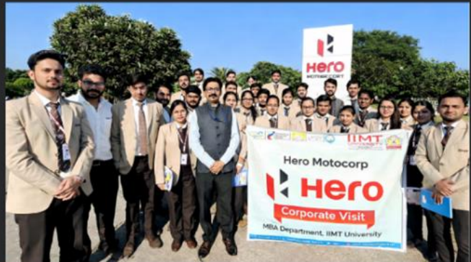
Hero Moto Corp