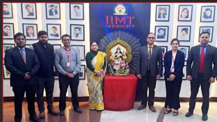
Medanta (Global Health Ltd.) - Campus Drive (One of India's leading private hospital chains)