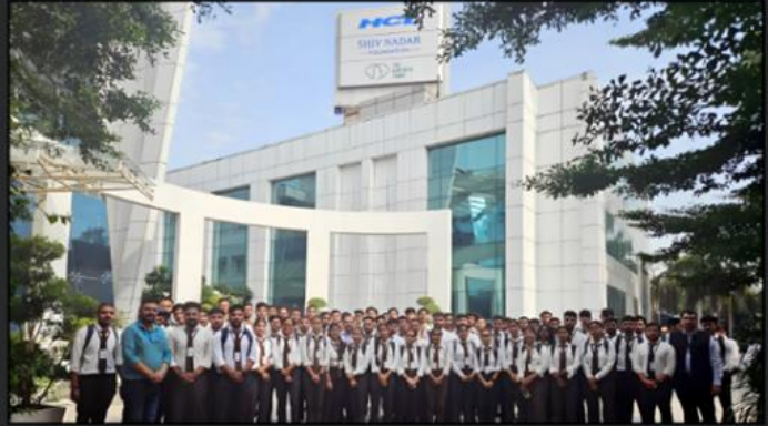
HCL Technologies Limited