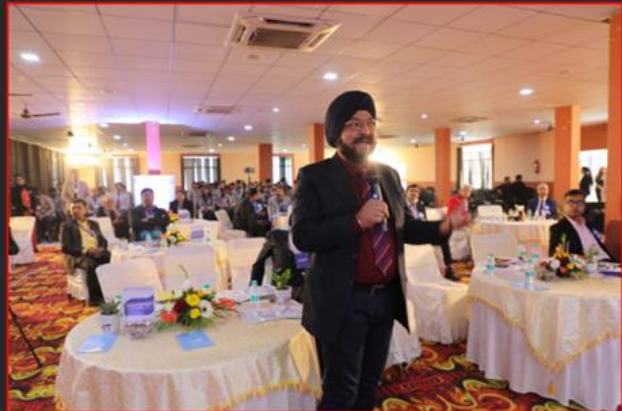
Talent Acquisition Lead (GENPACT India) HR Meet@IIMT